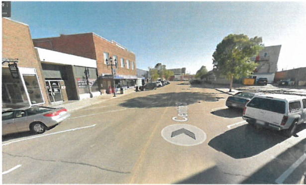
(Centre Street facing South)

Food trucks / trailers are often present during major special events and are also coordinated in conjunction with Public Markets. We also promote the location of Food Trucks and Trailers on private lands. There continues to be interest in the expansion of access for Food Trucks and it may be best to designate specific areas (for example – weekends in the downtown, Centre Street from 3 rd Avenue to Railway Avenue North). It's logical to cluster Food Trucks and Trailers in a designated area, thus creating an increase foot traffic to the downtown area by making the site a destination for visitors.