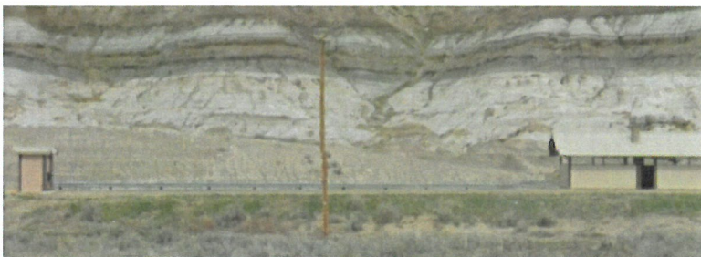
(Hoodoos Vending site)

Community Futures will be meeting with us on Wednesday, April 12 th to discuss the project and whether or not to proceed as initially planned. Discussion around the servicing costs and deployment of these units will be discussed. Adding power to any location would greatly increase these costs under the responsibility of the applicant, or in another arrangement with the Town (recovery of rent, etc).